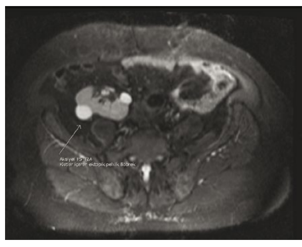
Fig. 2. Axial T2A MRI of pelvic kidney

treat a pelvic kidney patient. Preoperative evaluation is very important for planning the surgical approach (Fig. 2). Adamakis et al. described two cases of pelvic kidney coexisting with bladder cancer treated with radical cystectomy and extended lymphadenectomy<sup>(4)</sup>. The authors used computed tomography (CT) before surgery. In our patient, we performed magnetic resonance imaging (MRI) to obtain information on myometrial invasion of endometrial tumor. Both CT and MRI are very helpful for a surgeon to discuss the vasculature of the kidney, anatomic placement of the ureter and renal pelvis.